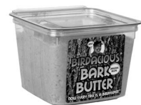
Jim's Birdacious® Bark Butter®

Nyjer® (thistle) is a favorite of goldfinches, and it contains fats and proteins that will help these birds maintain their yellow glow.